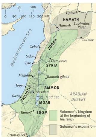
Second Adversary from North (Damascus) ESV Global Study Bible